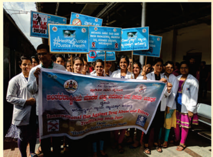
Pharm.D students during the rally