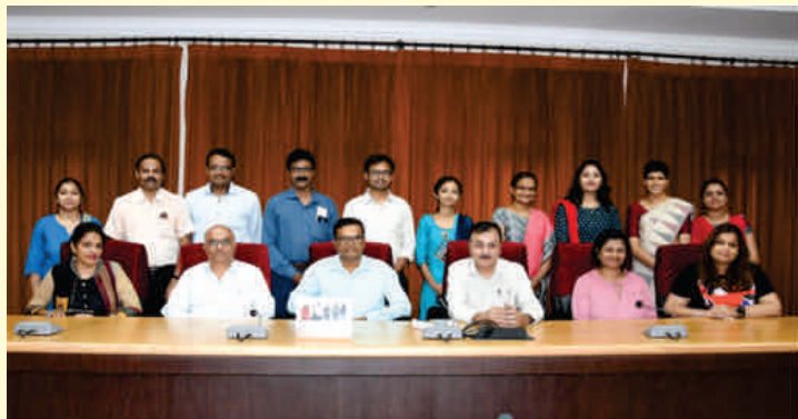
Staff of JSS AHER and La Trobe University with La Trobe – JSS AHER PhD Research Scholars