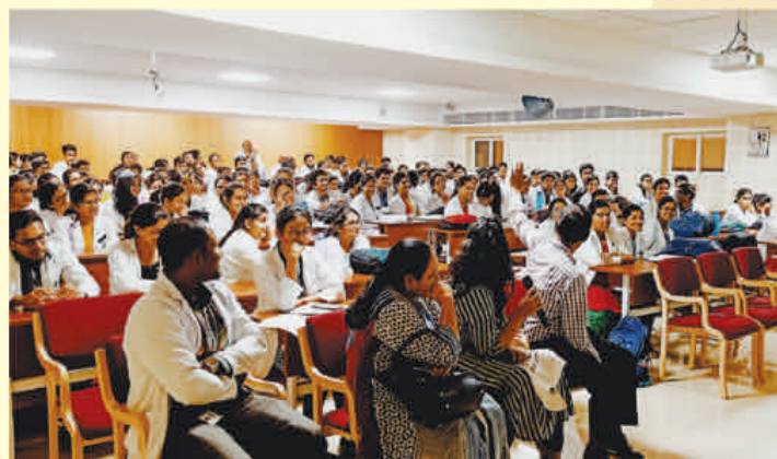
During IPE on Thyroid Disorders