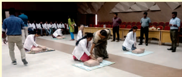
Fifth Pharm.D students during BLS training

Basic Life Support (BLS) course offered by American Heart Association was provided to V year Pharm.D students on 24 th July 2019 at Sri Rajendra Auditorium, JSS College of Pharmacy, Mysuru. The BLS guidelines were provided to the students one month prior to the course. During the course, the students got training in essential skills individually, as part of a team, and as team leader in different learning stations based on simulated clinical scenarios. The students learned the basics of resuscitation like chest compressions, adult and infant breaths, management of choking in adults and infants etc. Realistic simulations were focused on the following key concepts: proficiency in recognizing and initiating early management of peri-arrest conditions, of choking and the supportive care, identifying and treating, recognizing other life-threatening clinical situations such as cardiac arrest and providing initial care, applying BLS algorithms and effective resuscitation team dynamics. A total of 35 fifth year Pharm.D students successfully completed the training course and received the American Heart Association Basic Life Support certification card.