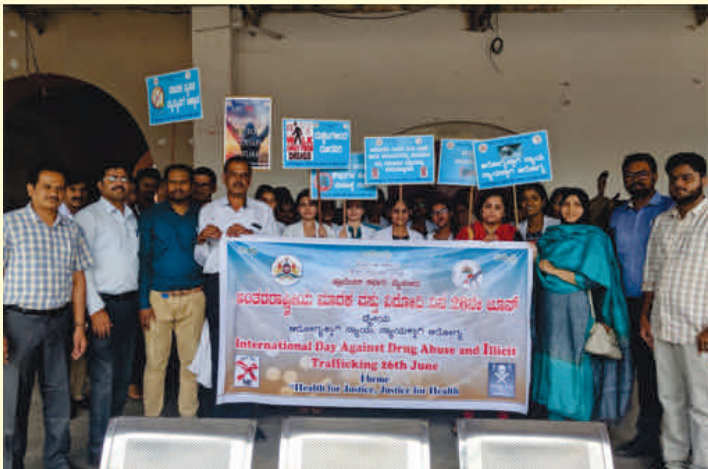
Inauguration of rally on the occasion of International Day against Drug Abuse & Illicit Trafficking

Department of Pharmacy Practice, JSS College of Pharmacy, JSS AHER, Mysuru actively participated in the rally on the occasion of 'International Day Against Drug Abuse & Illicit Trafficking' jointly organised by Drugs Control Department, Mysuru Division and Railway Protection Force held on 26 th June 2019 in Mysuru. The aim of the rally was to create awareness among publics on ill effects of drug abuse and different methods that need to be adopted by common people to overcome drug abuse & illicit trafficking. The rally was carried out within the premises of railway station.