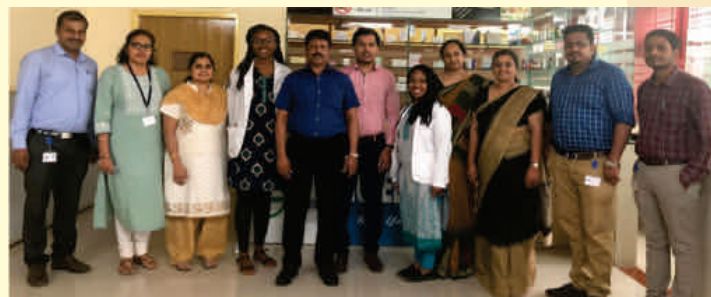
Howard University students with department staff

Also, they were exposed to activities of various departments like Pulmonology and DOTS centre, Immunization centre, Cardiology, Emergency, Psychiatry, Dermatology and Gastroenterology departments. They reviewed several cases from departments and discussed them with their respective facilitators. They had presented a case each on Dengue and Leptospirosis as part of their assignments required for their posting at JSS AHER. They attended the case presentations with Pharm.D Interns of JSS AHER. They were posted to Asha Kirana Hospital and Bharath Hospital and Institute of Oncology for a period of one week to learn about various opportunistic infections along with HIV and Cancer management respectively. They were posted at JSS College of Pharmacy, Ooty in the last week to give them an experience on practice of health care system in Government Hospital.