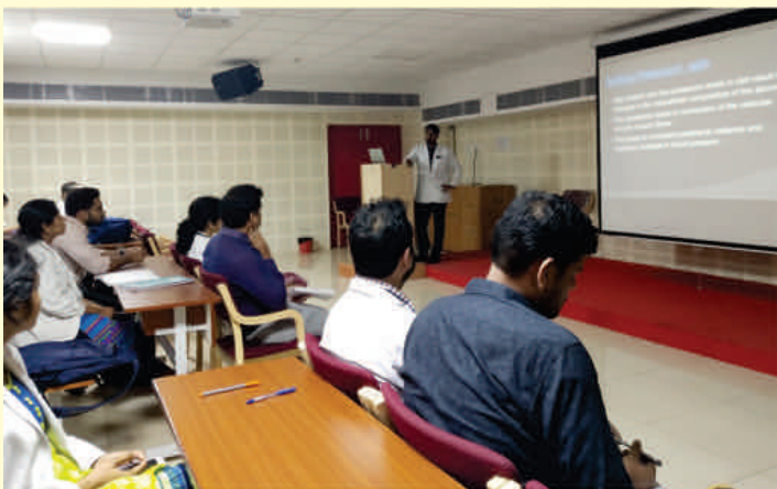
During IPE on Hypertension

Inter Professional Education (IPE) on Hypertension was held on 14 th August 2019 at Lecture Hall-1 at JSS Hospital, Mysuru. Eighth term students of MBBS and Pharm.D interns attended the session. Eighth term students presented on various aspects of Hypertension like the definition, epidemiology, types, risk factors, etiopathogenesis, complications and treatment.