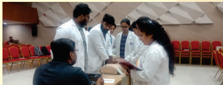
Pharm.D interns during ACLS training

Advanced Cardiovascular Life Support (ACLS) course offered by American Heart Association was provided to VI Pharm.D students (Interns) on 25 th & 26 th July 2019 at Sri Rajendra Auditorium, JSS College of Pharmacy, Mysuru. The ACLS guidelines were provided to the students one month prior to the course. During the course, the students got training in essential skills individually, as part of a team, and as team leader in different learning stations based on simulated clinical scenarios. Realistic simulations were focused on the following key concepts: proficiency in basic life support care, recognizing and initiating early management of peri-arrest conditions, managing cardiac arrest, identifying and treating ischemic chest pain and acute coronary syndromes, recognizing other life-threatening clinical situations such as stroke and providing initial care, ACLS algorithms and effective resuscitation team dynamics. Only those students who passed the written test were required to participate in a Mega code testing station which evaluated the achievement of the course objectives by the students. A total of 39 Pharm.D interns successfully completed the course and received the American Heart Association Advanced Cardiac Life Support certification card.