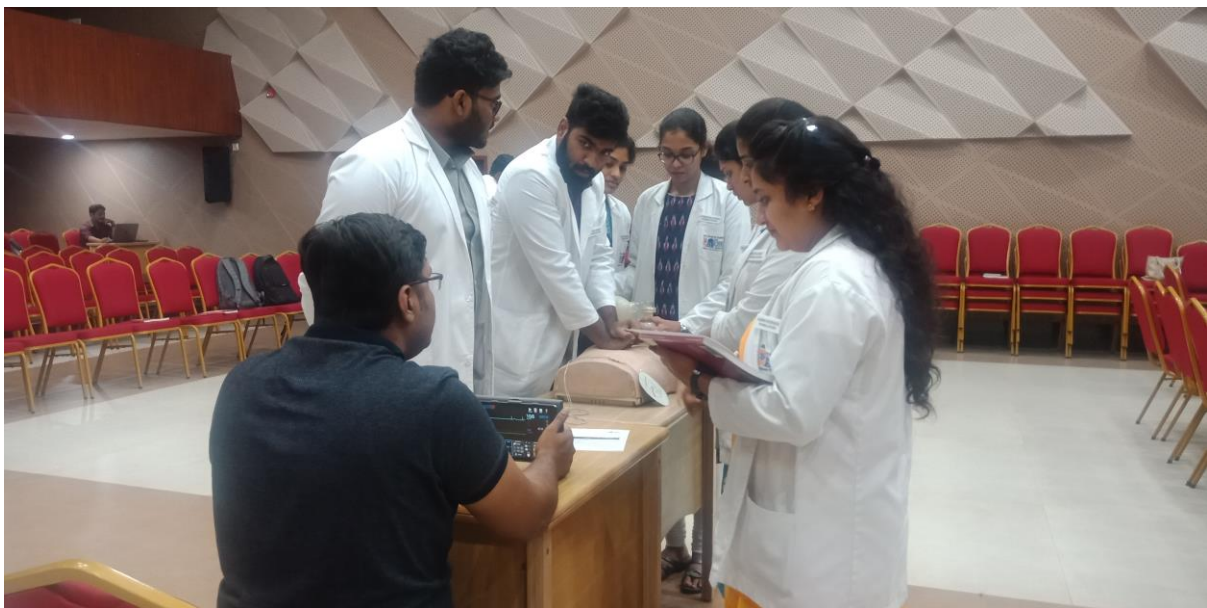
Instructor, Tech2People, Healthcare & Education Pvt. Ltd., Manipal conducting practical sessions for students