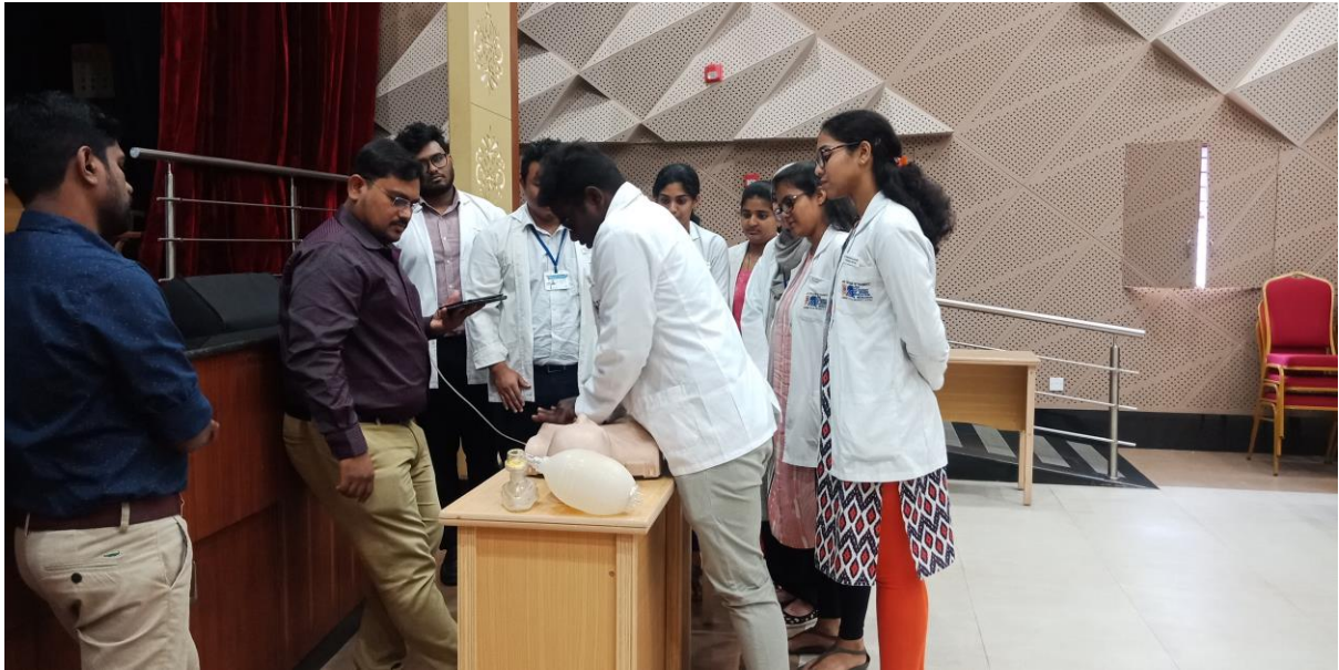
VI Pharm.D students performing ACLS in presence of instructors to develop expertise