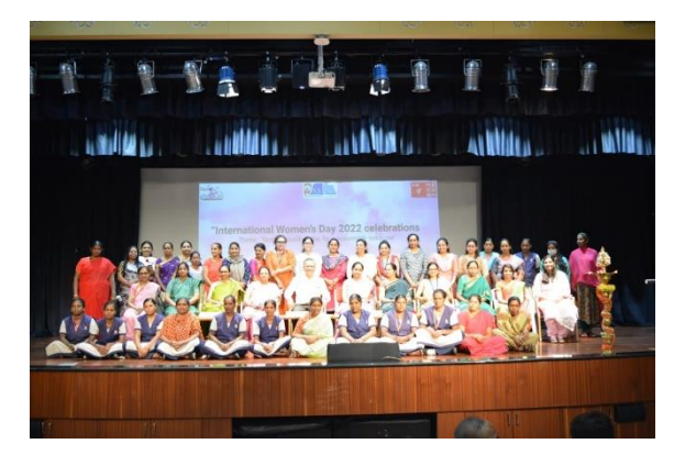
staff were present during the occasion.