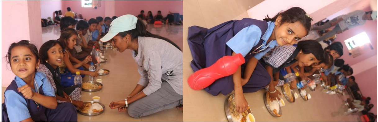
Organized one day food to Government school, Hulikere