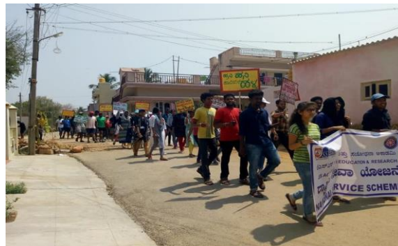
Rally on Water usage and Environmental management