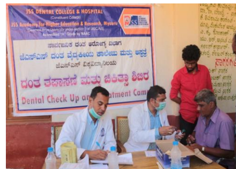
Dental Checkup and treatment by JSS Dental College and Hospital