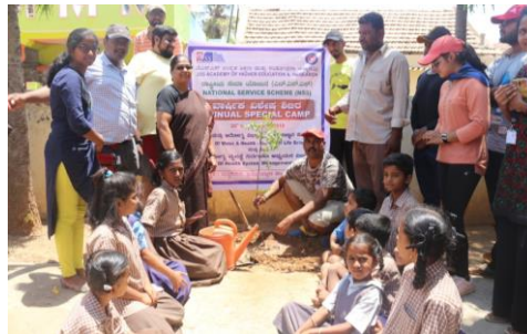
Plantation Drive at Majjigepura with students of Govt. Primary School and villagers