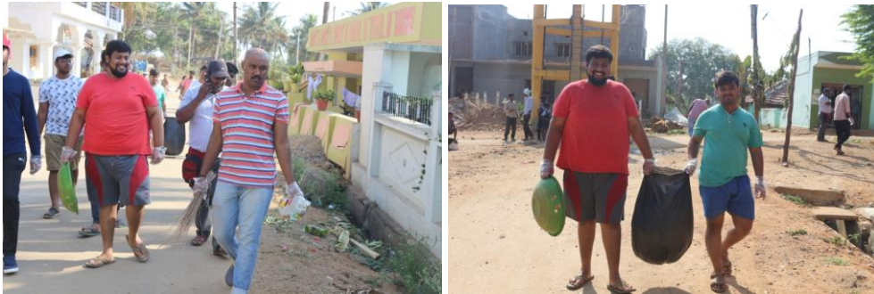
Volunteers in the Shramadhana activities