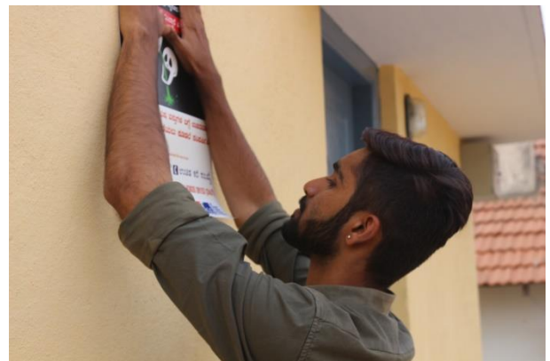
Door to door campaigning on maintaining cleanliness and free from open defecation