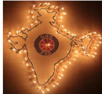
Oath for Swachh Bharath and National Integrity