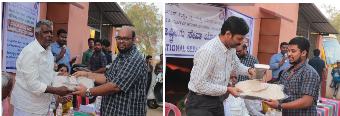
Inauguration of NSS Annual Special Camp

After the inauguration function, everyone moved towards the temple convention hall and had dinner at 8:30 PM followed by meeting with the NSS officers in order to discuss about next day's programs, Grouping of all the NSS Volunteers, Assigning each group of volunteers to carry out various activities assigned to the individual group and Volunteers then wrote the NSS diary before going to bed.