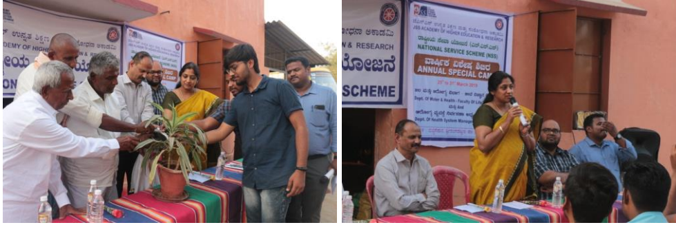
Inauguration of the special annual camp