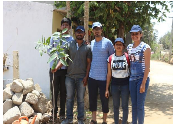
Shramadhana and Planatation Programme by our NSS Volunteers