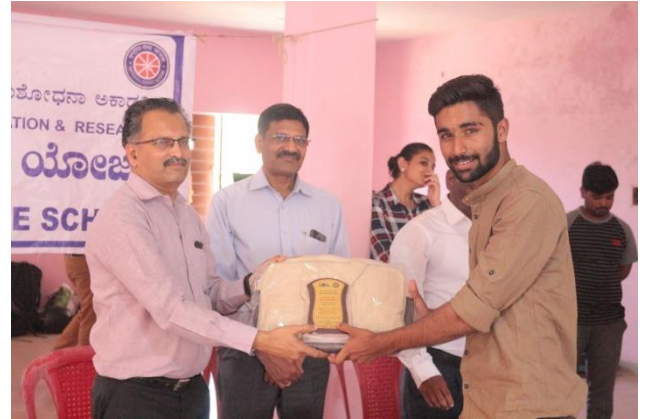
Feedback given by NSS Volunteers and Best NSS Volunteers