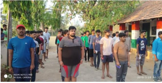
Flag hoisting sessions