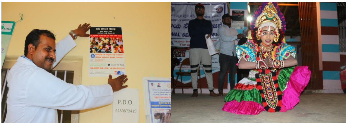
Poison information center and cultural program