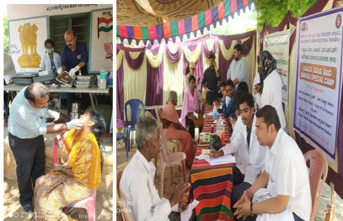
Free Dental Camp