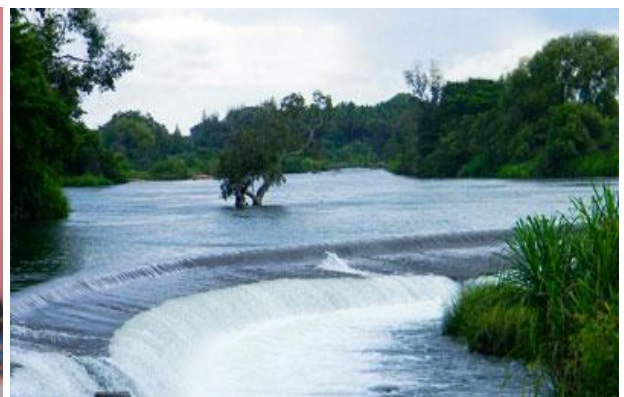
Nearby scenic beauty of Hulikere Village