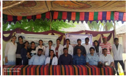
Free Health Screening camp