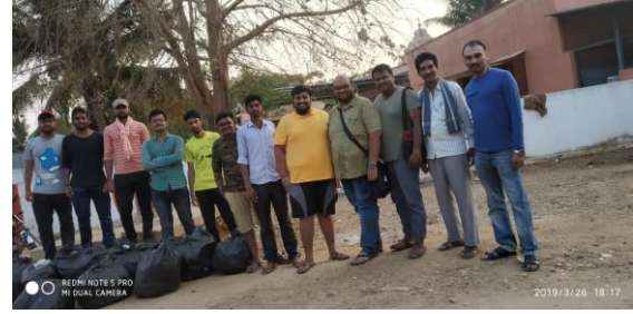
Waste Collections Drive