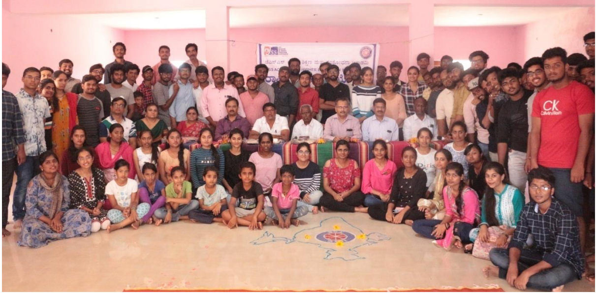
Group Picture of the Volunteers at Majjigepura