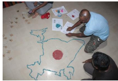
Shibira Jyoti Preparations