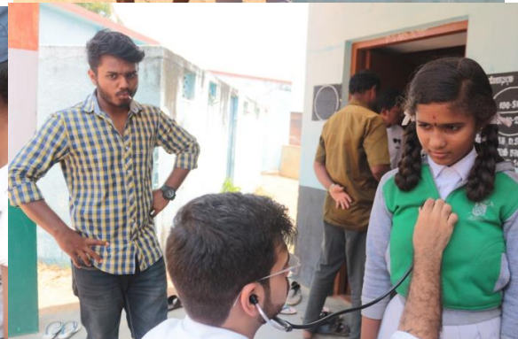
Medical Health Checkup (General, Paediatric and Ophthalmology) by JSS Hospital