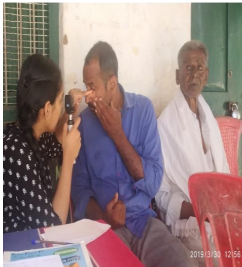
Free Medical Camp with Nutritional Assessment