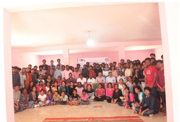
Shibirajyothi and Group photo of NSS Volunteers