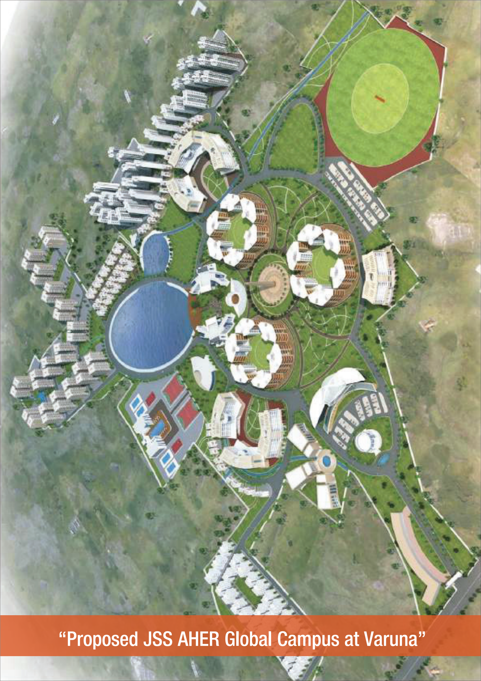
“Proposed JSS AHER Global Campus at Varuna”