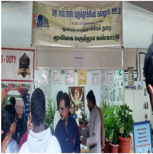
Glimpses of medicinal plant exhibition to provide public medicinal plant awareness