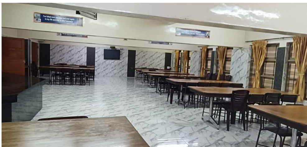
Glimpses of hostel cleanliness